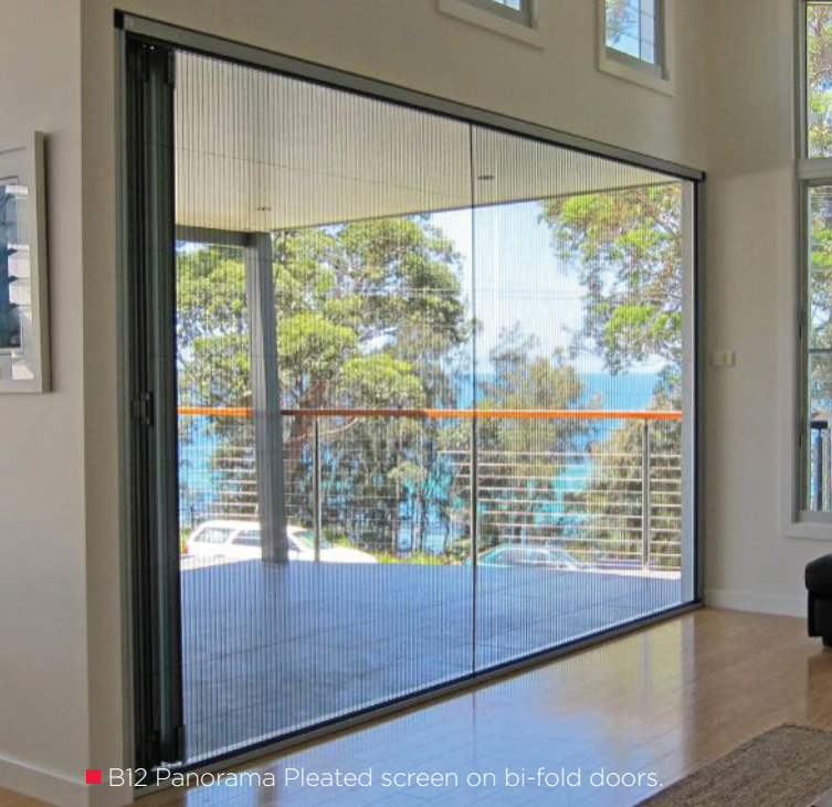
■ B12 Panorama Pleated screen on bi-fold doors.

Freedom Retractable Screens® — innovative screens for modern Australian living!